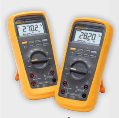
Fluke 28 II/27 II