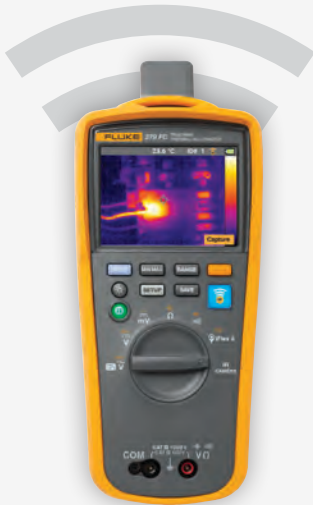
Fluke 279 FC