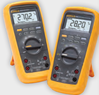
Fluke 28 II/27 II