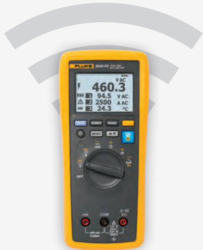
Fluke 3000 FC