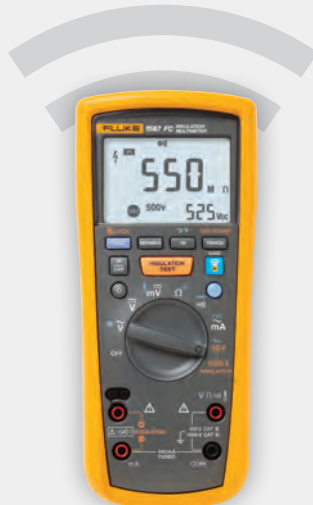
Fluke 1587 FC