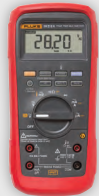
Fluke 28 II Ex