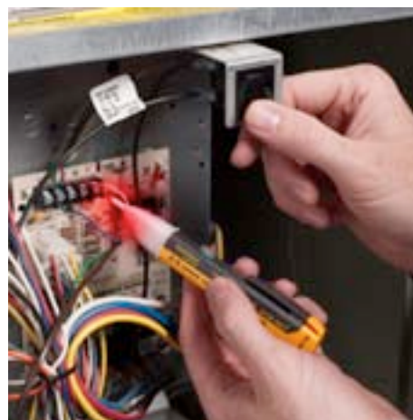
Low volt version