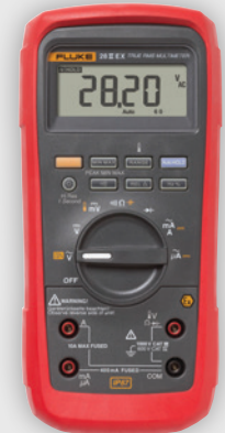
Fluke 28 II Ex