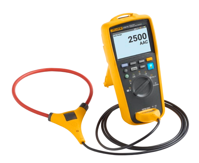
Figure 1. Fluke 279 FC with the iFlex Flexible Current Probe