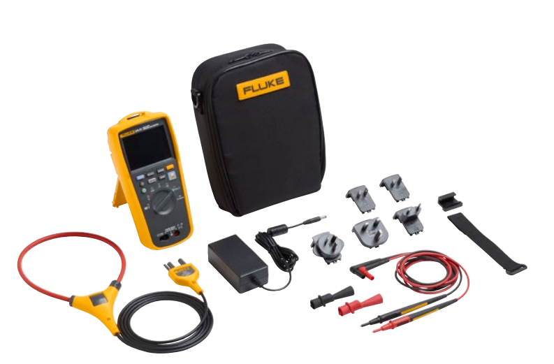
Figure 2. Fluke 279 FC/iFlex TRMS Thermal Multimeter Kit

Figure 1. Fluke 279 FC with the iFlex Flexible Current Probe